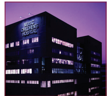
MUSC Children's Hospital