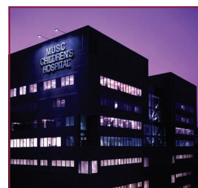
MUSC Children's Hospital